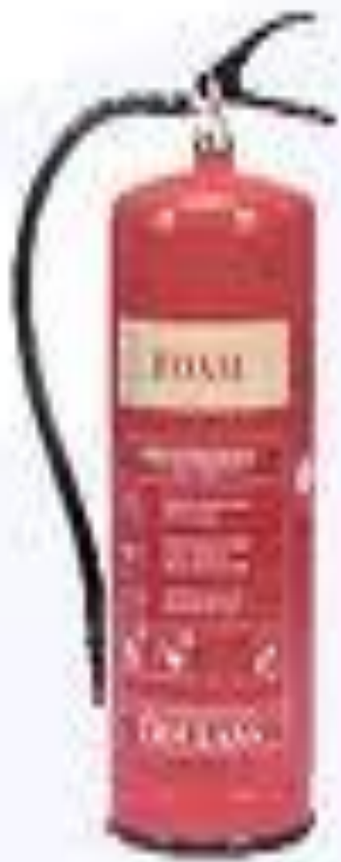
cream for foam