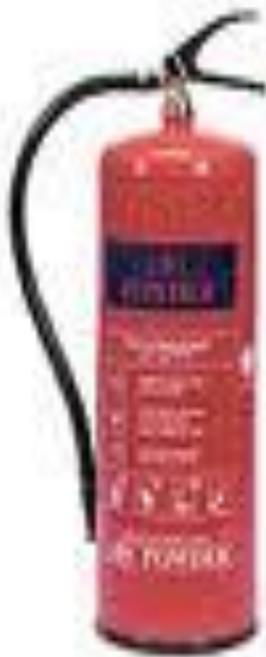
blue for dry powder