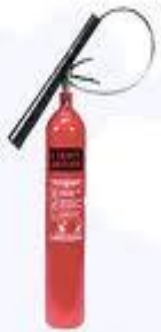
black for CO2