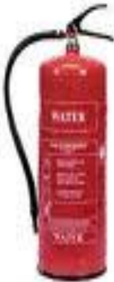
red for water